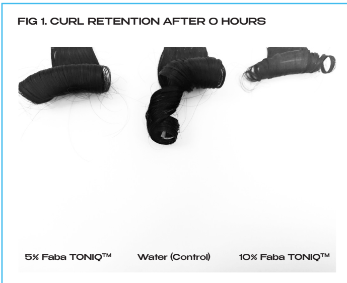
FIG 1. CURL RETENTION AFTER 0 HOURS