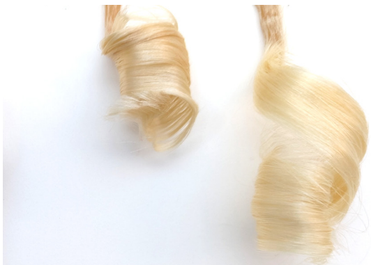
Faba TONIQT TM