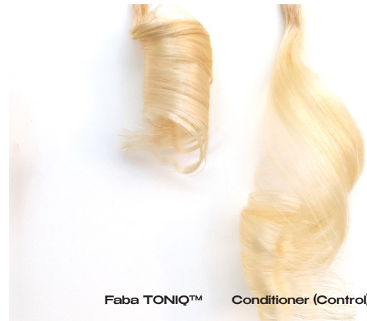
Faba TONIQT TM